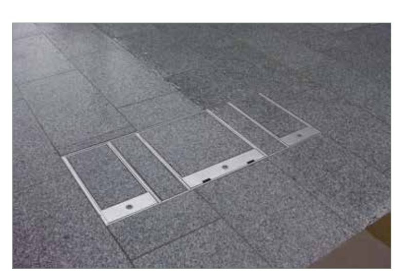
Food Trucks use this box to Refill their Potable Water Tank during the day to make their Coffee/Tea & Wash Up.