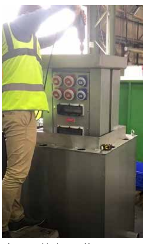
Use this box for multiple operators, where use in the open position is acceptable - eg on campus.