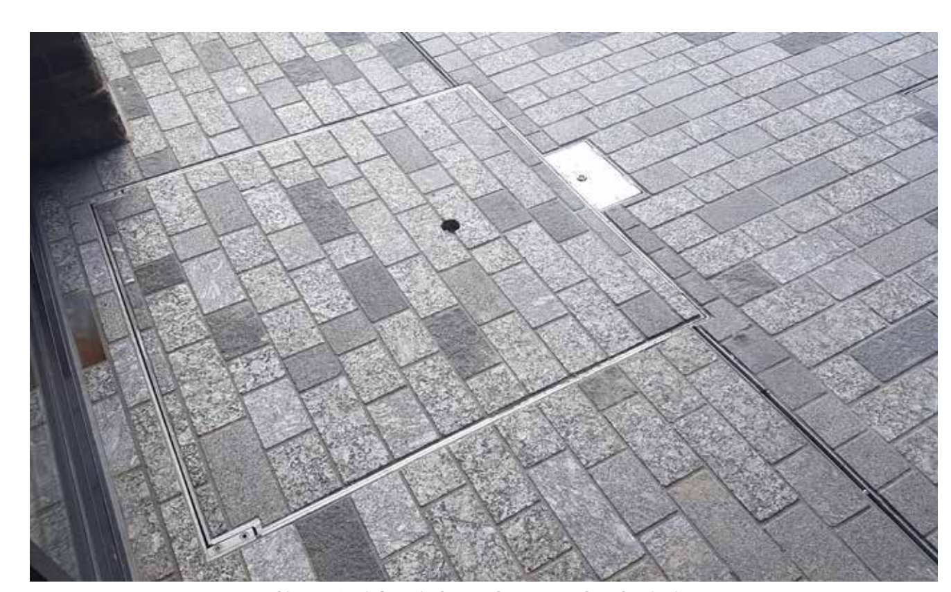
This Event Box is for major large scale events - such as plugging in an Ice Rink in addition to the regular food cart and lighting demand that accompanies this.