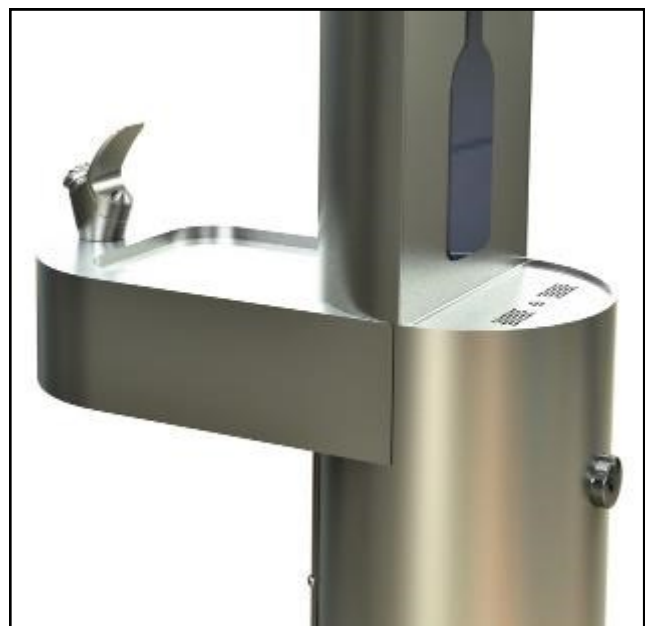
Optional Extra: Drinking fountain bubbler tap & basin